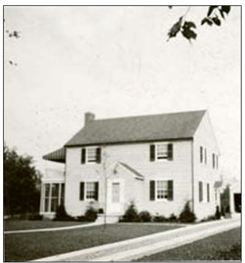
W.E.B. Du Bois House 1940s, picture from http://www.library.umass.edu/spcoll/collections/galleries/dubois12.htm